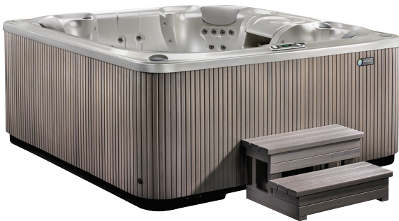
Pulse shown with Pearl shell / Coastal Gray cabinet and Everwood step